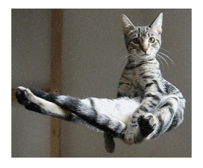
*** REMINDERS ***