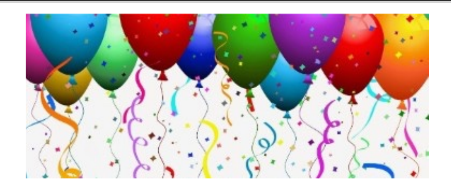
For those celebrating birthdays & anniversaries:

For your incredible work & for your generous hearts!