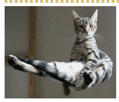
*** REMINDERS ***